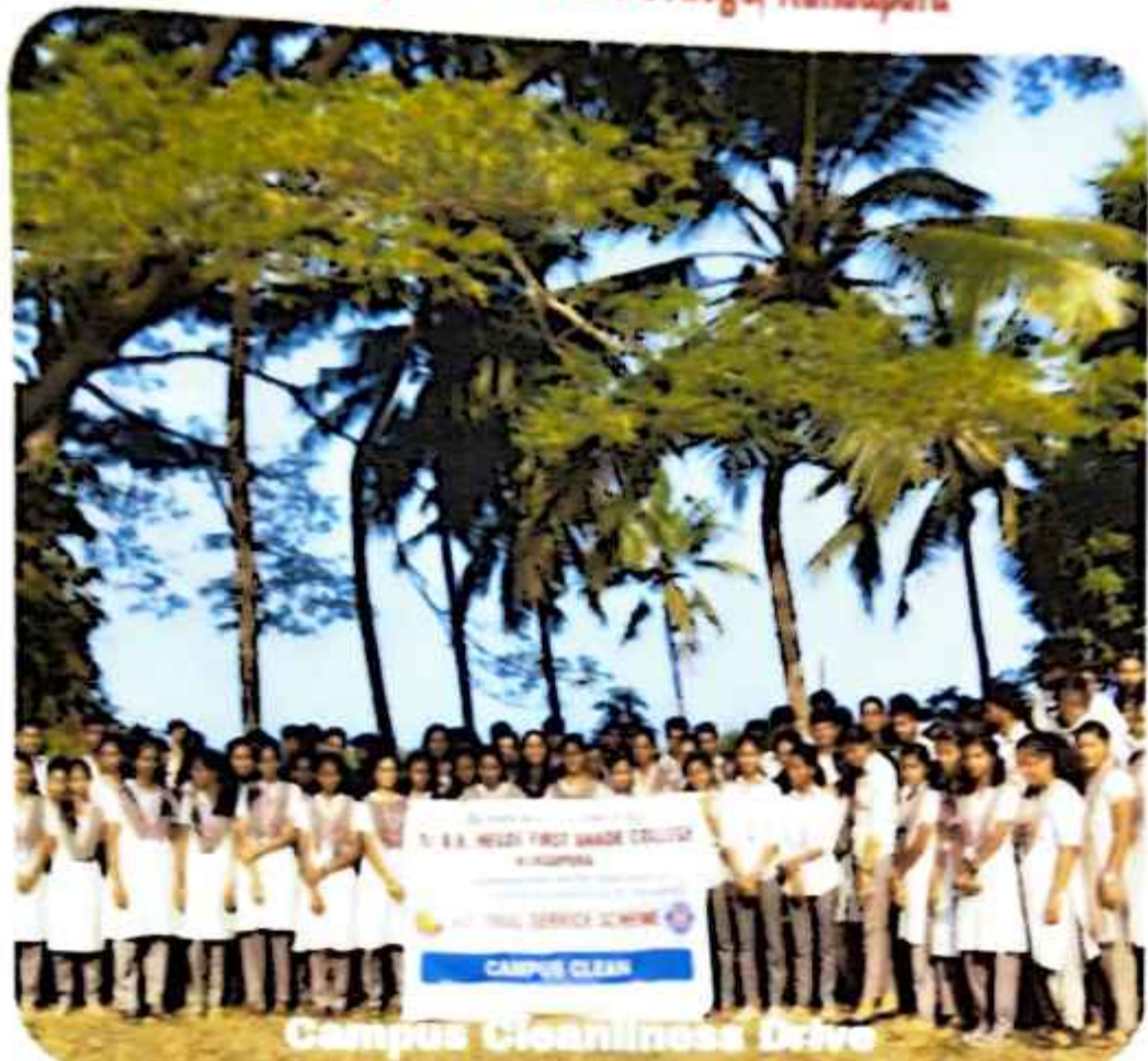
Campus Cleanliness Drive